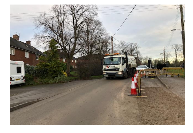
Brackley Lane – road sweeping