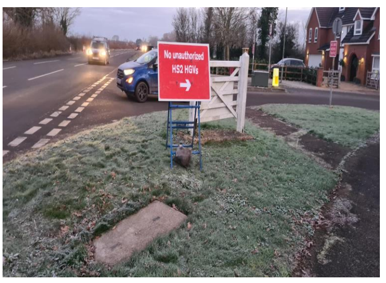
Additional signage Cotswolds Way